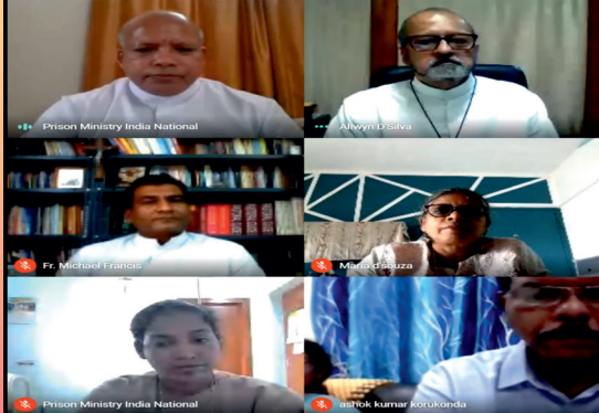
PMI Online Retreat September, 2020