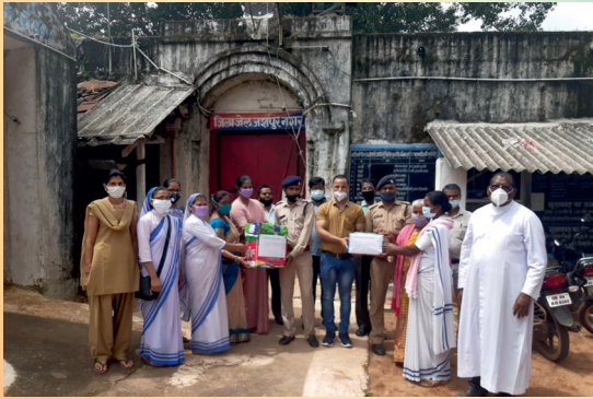
PMI Volunteers Distribute Sanitizers and Masks to Jashpur District Prison