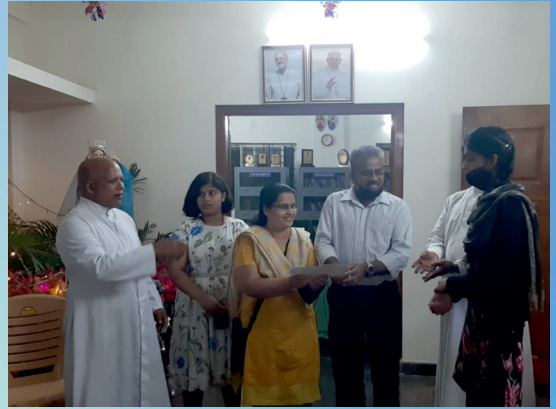
Distribution of Scholarships to Prisoners' Children, Bengaluru