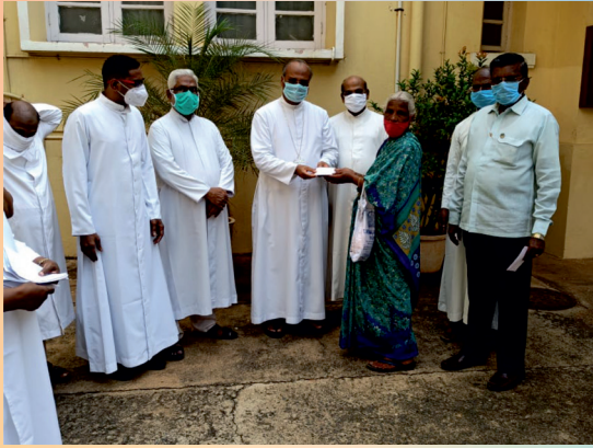
PMI Chennai Unit Distributes Educational Scholarships to Prisoners' Children