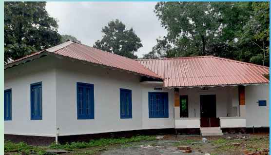
Renovated Snehashramam Thrissur