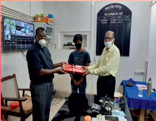
PMI Chhattisgarh Donates Clothes to Prisoners