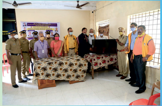
PMI Volunteers Distribute TV to Kottayam District Jail