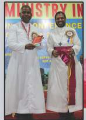
Release of the books during the Conference