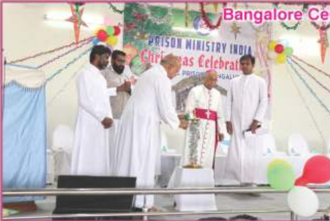
Bangalore Central Prison