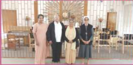
Launching of New Mission of PMI, DRC