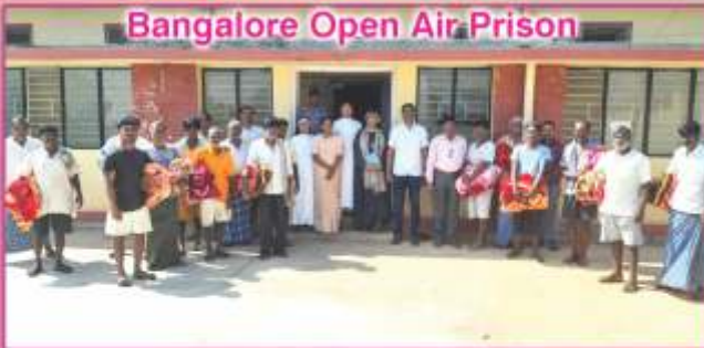
Bangalore Open Air Prison