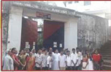
Attingal Sub Jail, Kerala